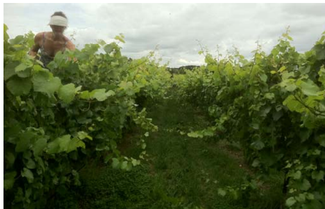
'triffid' vines after the January rains

With a diligent crew and strategy of 'daily vigilance' we declared war against the mildews. Our lyre trellis gives the advantage of dividing a single thick canopy into two less condensed ones, dramatically increasing airflow and reducing the footholds for disease. But no one strategy was enough in a year like this; thinning green shoots, effective spray programs and hand separating the triffid-like canopy until the very end of harvest. We were finally rewarded with classic autumnal ripening weather and again our dual canopy utilizing all available sunlight, culminated in our best and biggest harvest to date. A testament to our powerhouse vineyard team!