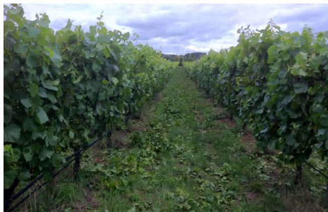
the same rows after a 'short back and sides'