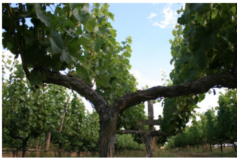
The Lyre trellis— Divided We Stand!

Our site has some inherent advantages in a year like this. Being such a cool climate site, our vineyard coped better with the season's weather challenges. Also, our divided trellis had a twofold advantage. The divided canopy captures more sunlight into each vine, also allows for greater ultraviolet penetration and air movement thus lowering humidity and easing disease pressure. Most importantly, our stella vineyard team maintained an unbroken vigilance, working all hours, day & night, to ensure we brought the harvest home in great condition. Fortunately we received exceptional ripening weather for March, leading to a great April harvest, with some of our purest wines to date. Please enjoy the fruits of our labour!